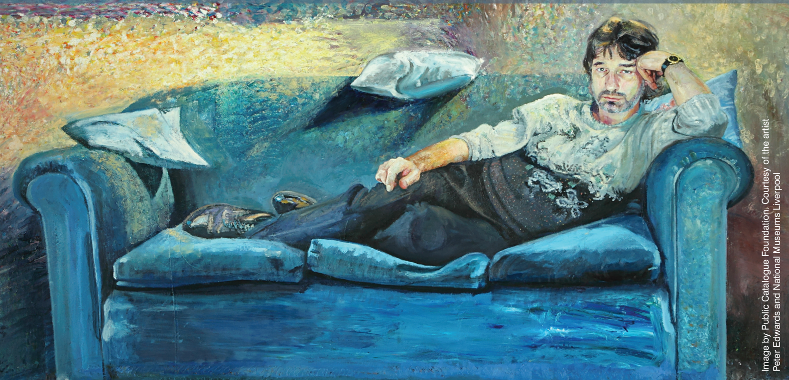
Image by Public Catalogue Foundation. Courtesy of the artist Peter Edwards and National Museums Liverpool